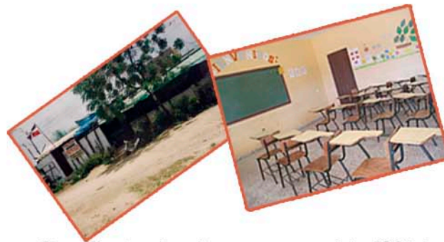
Our first school was opened in 1994 in San Pedro.