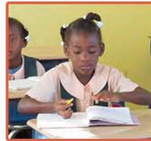
They are promoted to grades 5 through 6 as their skills improve.