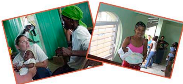
We have built a hospital to care for the poorest in the region. We also maintain mobile medical clinics that visit over 125 communities annually bringing health care to those that would otherwise be unserved.