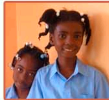
A Middle School prepares them for High School studies.