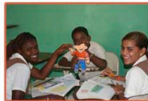
High School prepares them for the state university system. All our schools are fully accredited by the national education council,