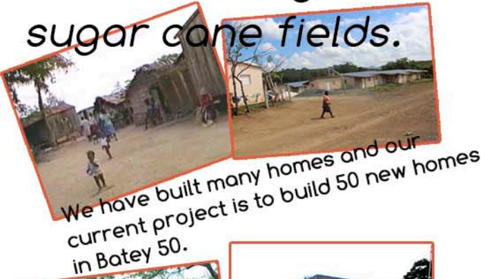
We have built many homes and our current project is to build 50 new homes in Batey 50.

Since 1984 we have been working to improve the lives of children living in the sugar cane fields.