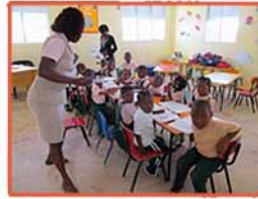
Children begin their education in grades kindergarten through grade 4.