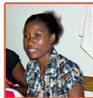
Those that graduate from High School and wish to continue their education receive financial aid from US sponsors.