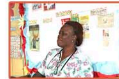
Doctors and Administrators